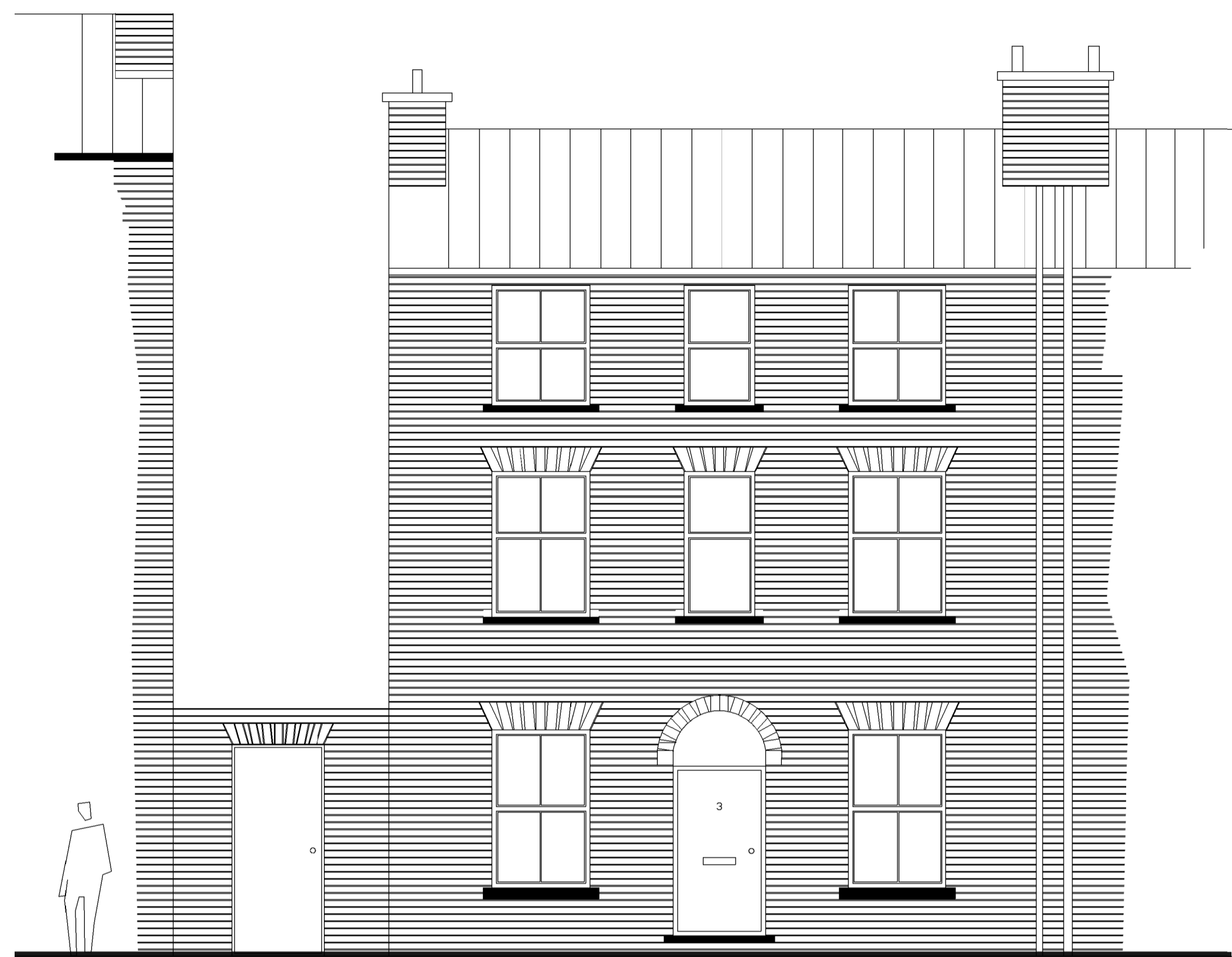
Existing front elevation 1:50

NOTE This drawing is not to be scaled. All dimensions to be checked on site and any discrepancies to be reported. All drawings to be read in conjunction with specification where applicable.