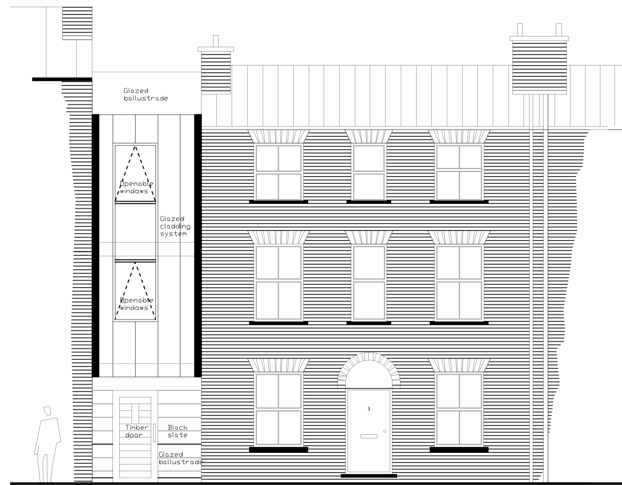
Proposed front elevation 1:50