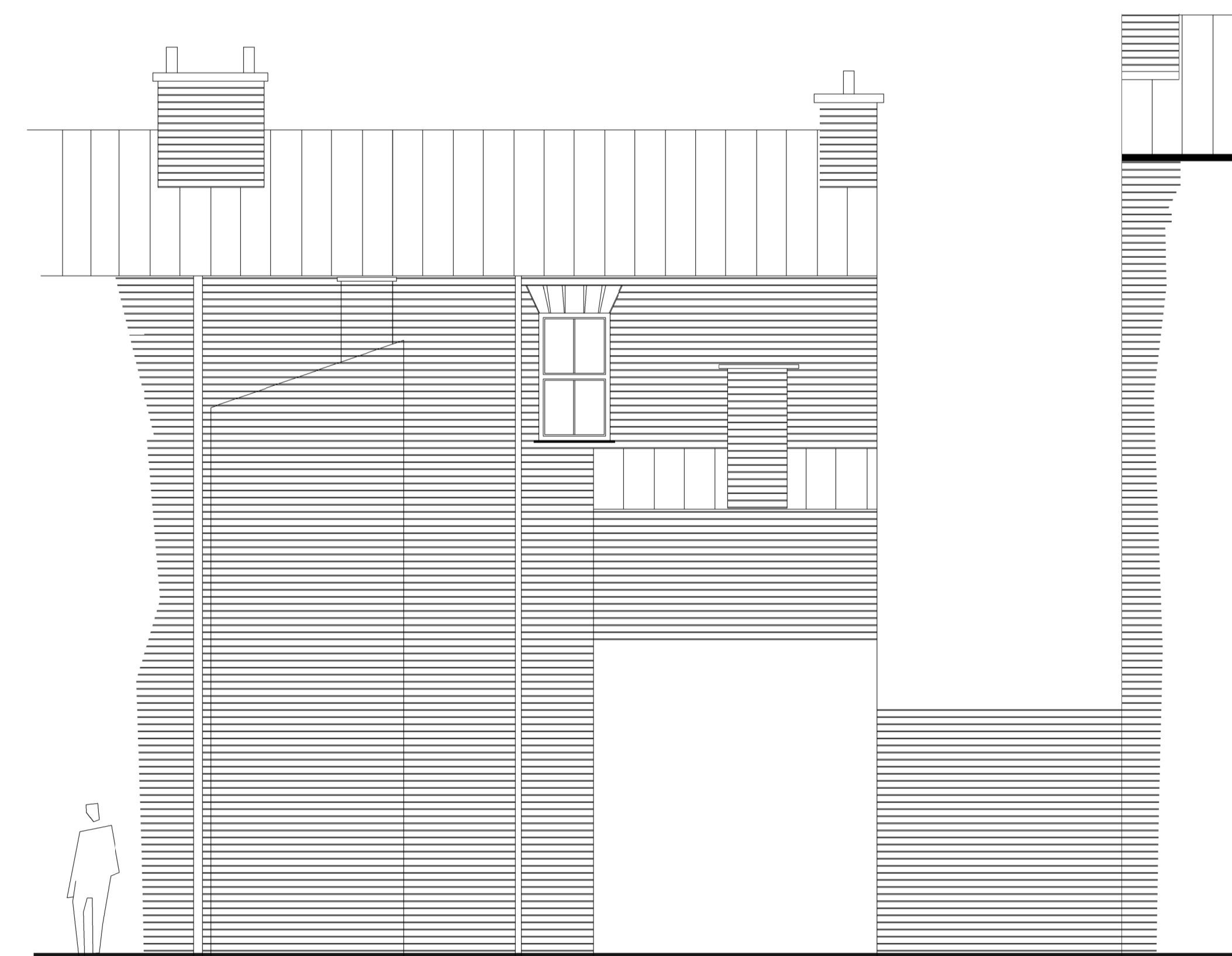
Existing rear elevation 1:50